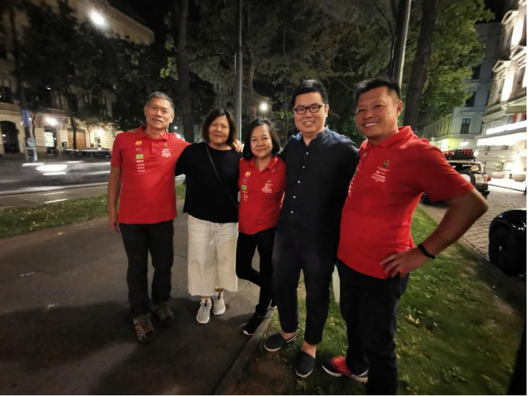
Croatia - Zagreb, Zadar, Trogir, Dubrovnik

For the next leg of the expedition, the convoy moved onto Croatia, stopping by Zagreb the capital of Croatia. There, the convoy moved southwards to Zadar and subsequently travelled alongside the coastline close to Adriatic sea, passing by Trogir and Dubrovnik, cities that have an exceptional history and rich in cultural heritage.