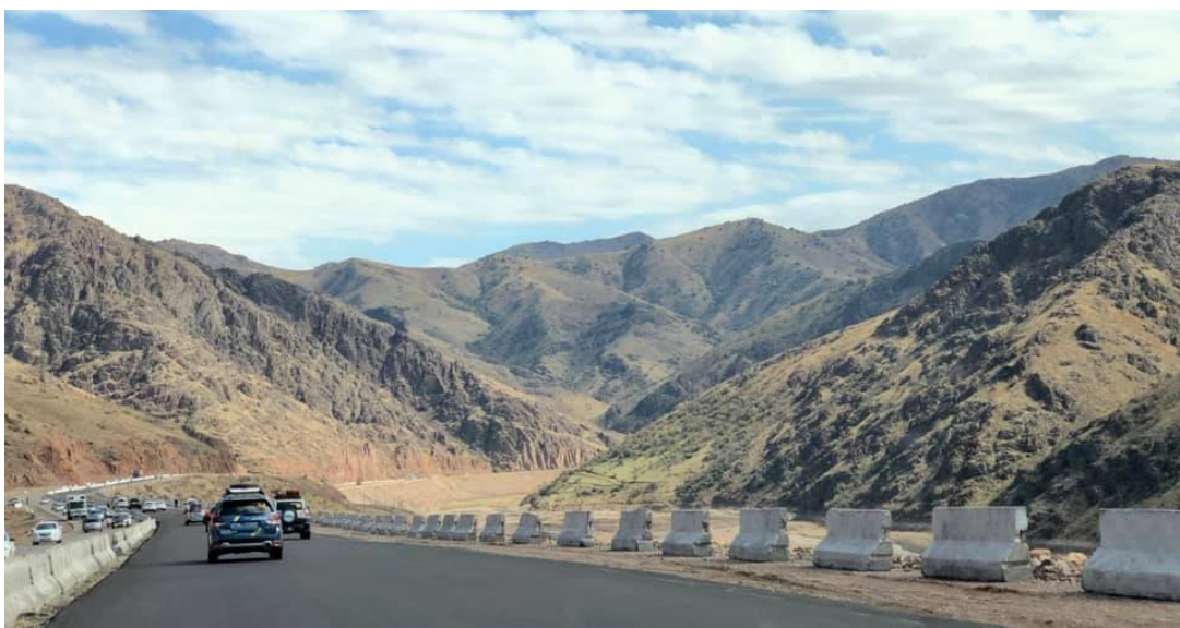
Kyrgyzstan - Toktogul, Bishkek