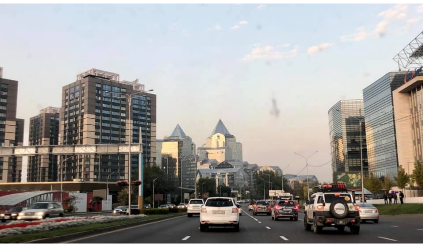
China - Xin Jiang, Xi'An, Gan Su

Moving on from Central Asia, the convoy travelled to China. Starting from Xin Jiang, they covered a 200km drive from Urumqi to Turufan, where they visited the Karez irrigation system and Gao Chang ancient city.