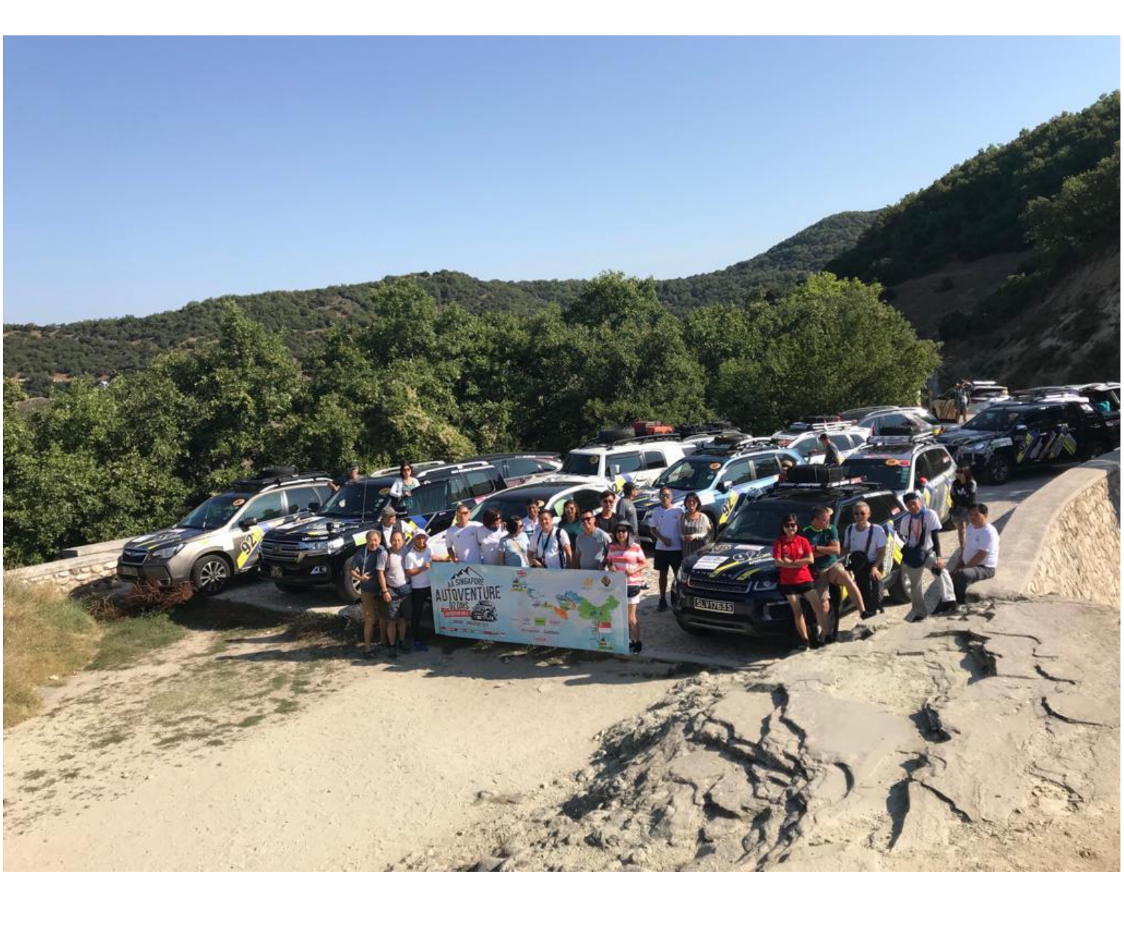
Turkey - Istanbul, Safranbolu, Cappadocia, Mardin

The next leg of the trip, Turkey! Crossing into Turkey via the Kipi Border Crossing Point, the convoy continued southwest, passing by notable locations such as istanbul, Safranbolu, Cappadocia, where participants experienced a hot air balloon ride and Mount Nemrut, one of the most iconic sights of Turkey and a UNESCO world heritage site. After Mount Nemrut, the convoy proceeded to Mardin, an enchanting city with its beautiful architecture, archaeological wonders and historical heritage as evident from its Assyrians, Persians, Romans, Byzantines and Ottoman influences.