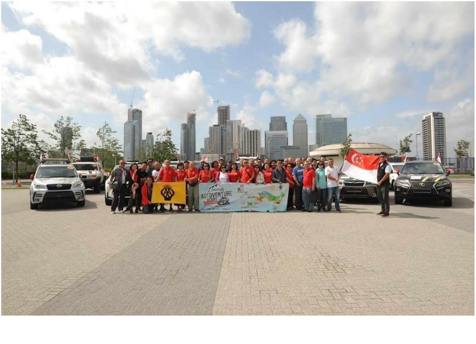
Germany - Cologne, Baden-Baden, Konstaz and Munich

The next leg of the trip, Germany! After taking a car ferry into Calais Ferry Terminal and driving into Cologne, the group arrived in Germany. Passing by Cologne Cathedral, the group headed southeastwards, passing by Baden-Baden and iconic Blackforest, and the city of Konstaz and arriving in Munich.